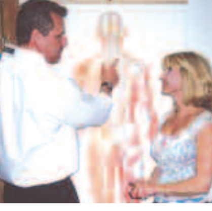
An Initial Consultation