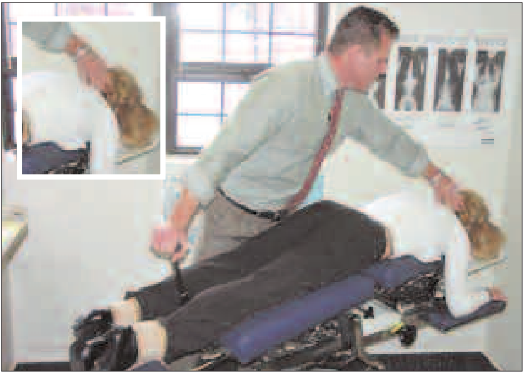
Dr. Pyne performing cervical flexion/distraction (disc decompression).

Disc decompression treatment is one of the hottest topics in the health care arena. This type of treatment has helped thousands of people avoid low back surgery.